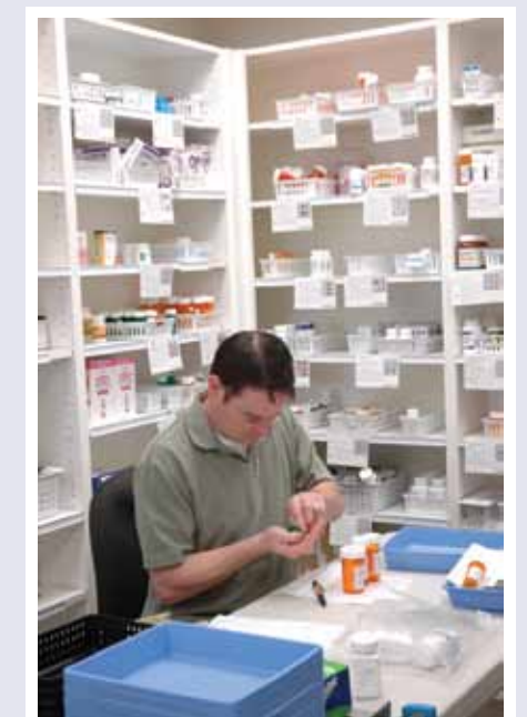
17 DIFFERENT VOLUNTEERS HELP OUT IN THE DISPENSARY EACH WEEK.